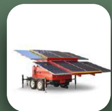
Mobile Solar Generator System