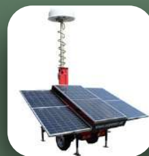
Mobile Solar Radar Station