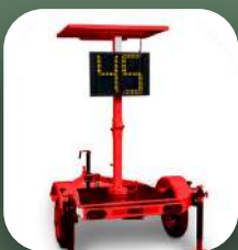
Mobile Solar Traffic Sign