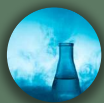
Conventional batteries store Energy Electro Chemically