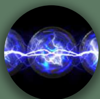
Adpower's Super-cap stores Energy Electrostatically