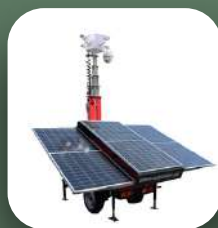
Mobile Solar surveillance